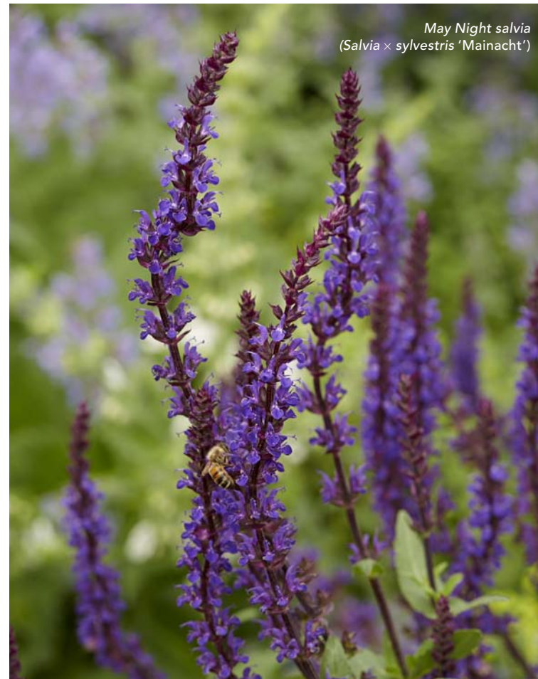
May Night salvia ( Salvia x sylvestris 'Mainacht' )

After the patio, more hardscaping followed, including a series of antique granite pillars and steps, fieldstone walks, picket fencing, and a pea-stone driveway. These elements complement the site while paying homage to the land's New England roots. To round out the aesthetic, flower boxes were attached