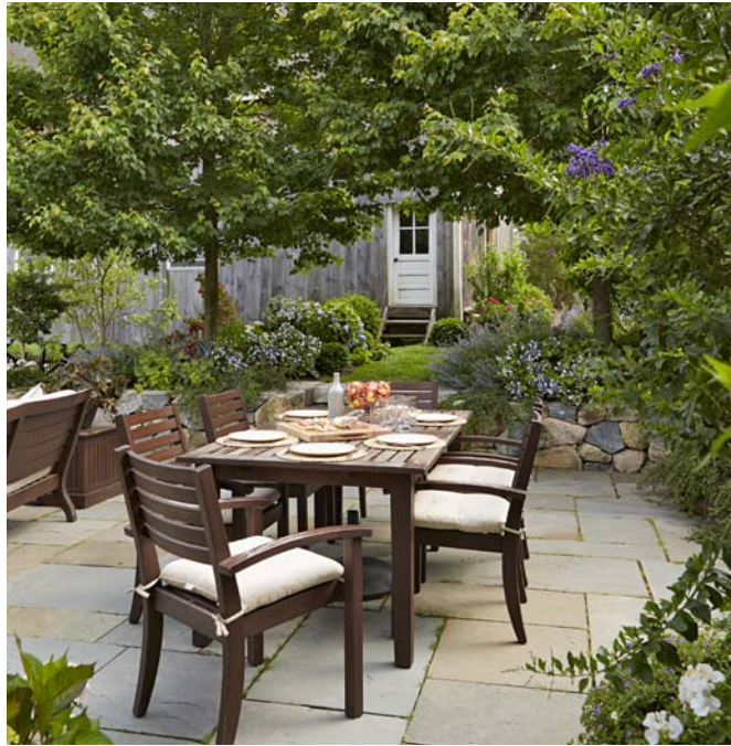
ABOVE A 23x27-foot bluestone patio is the foundation for frequent entertaining, with room enough to rearrange furniture depending on the size of the crowd. BELOW Transitions between varying grades help define outdoor rooms with different functions. Steps lead down from the back porch and wood deck to the stone patio, and more steps lead further down to the fenced dog run. Fencing is similar throughout the property, and hard surface materials are limited to pea gravel, granite, fieldstone, and bluestone so the entire layout remains cohesive.