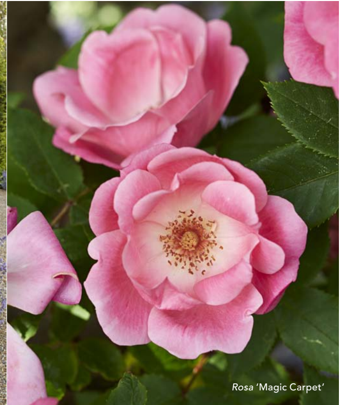
Rosa 'Magic Carpet'

ABOVE LEFT A welcoming pea gravel driveway opens amid a break in the tree border that runs along the street. Planted with Thuja occidentalis 'Elegantissima' and T. plicata 'Green Giant' and layered with other evergreen and deciduous trees and shrubs, the border gives the property a more private and restful feel. BELOW Perennial plantings near the entrance to the house are repeated in other areas, connecting every view.