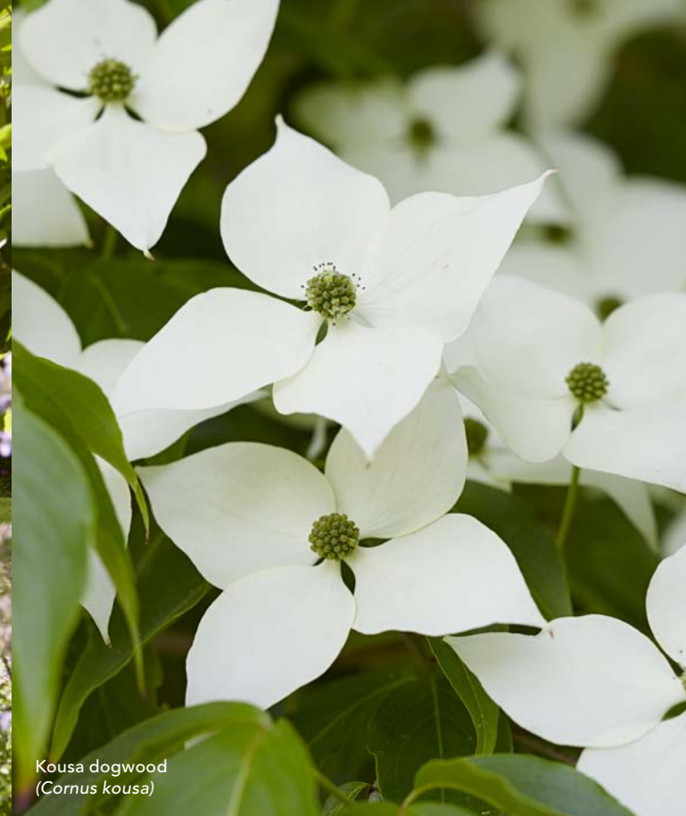
Kousa dogwood ( Cornus kousa )