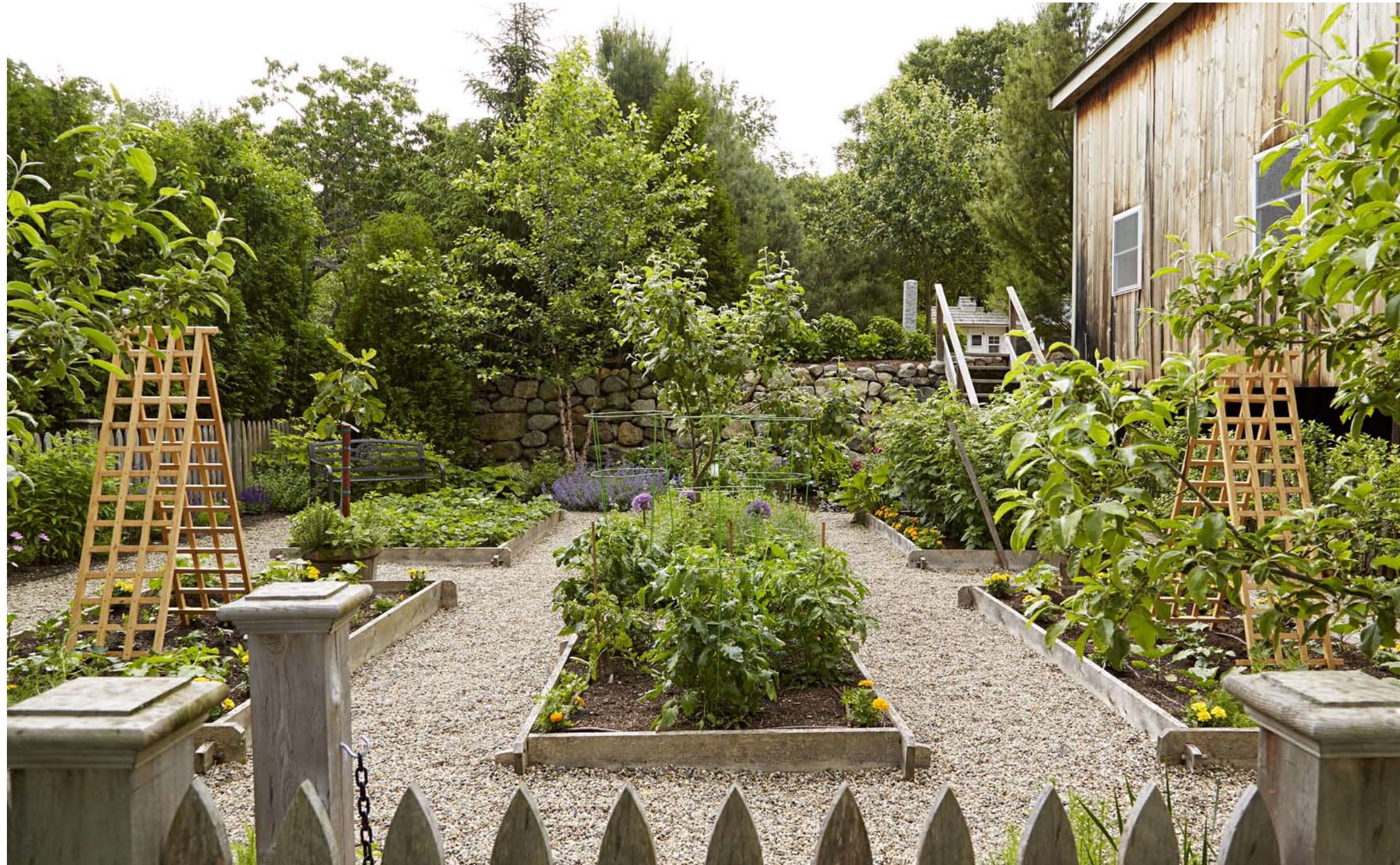
TOP Chris keeps approximately 40,000 bees at the farm. Much of their annual 90-pound honey crop makes its way into holiday gift baskets. ABOVE James planted French marigolds ( Tagetes patula ) along edges of the raised beds to deter whiteflies and some nematodes. RIGHT The fenced 35x30-foot vegetable garden holds six raised beds. A young apple tree anchors the center of the garden.

For more information, see Resources on page 110.